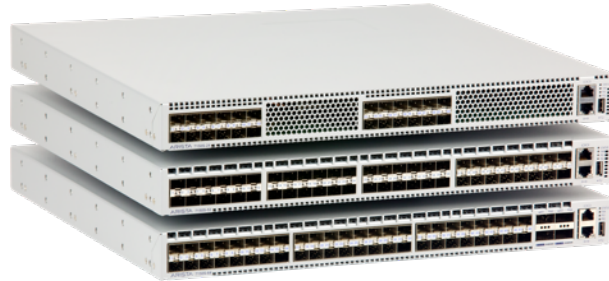
Arista 7150S family

Designed to suit the requirements of demanding environments such as ultra low latency financial ECNs, HPC clusters and cloud data centers, the class-leading deterministic latency from 350ns is coupled with a set of advanced tools for monitoring and controlling mission critical environments.